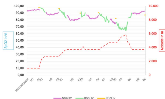
Figure 1. Continuous SpO 2 -measurement during the ascend of Mt Kilimanjaro

Our results show a decline of SpO 2 with increasing altitude (see Figure 1). The lowest mean SpO 2 during exercise was recorded during the summit trek (B5SpO 2 = 68.8%). The lowest mean SpO 2 during sleep was recorded on Kibo Hut (4700 m) (N5SpO 2 = 77.6%). Additionally, the measurements at altitude during sleep (N5SpO 2 ) have shown to be significantly lower than the conventional measurements at rest (RSpO 2 ) in the morning.